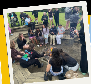
Sharing Fun Times

WHANGAREI GIRLS' HIGH SCHOOL SWITCH INFORMATION EVENING